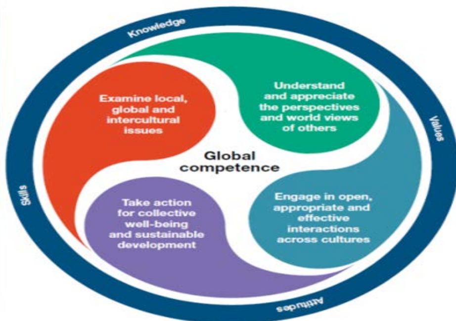
Fig. 2 Global Competence of a foreign language

Reflection means thinking about the past and summing up the experience and learning lessons. The reflection of teaching activities refers to the experience of the teaching activities. Teachers' reflection on teaching is a self-issuance of teachers to improve their teaching level. Teachers reflect their own teaching behaviors, recognize their own shortcomings in teaching, and improve in the next teaching process. Scientific and objective reflection on one's own teaching activities will help to improve the teaching level and promote the comprehensive development of young children. Teaching reflection can also improve teachers' sense of responsibility.